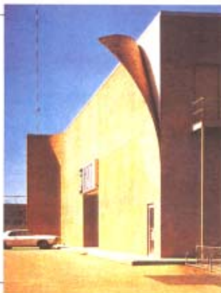
The National Gallery

Architect: Studio Site (four architects) Place: Richmond, Virginia, USA Date: 1971-2 ■ It's not a painting, but the brick facade still isn't falling off. This is a trompe l'oeil in three dimensions by the United States architects who designed this quirky supermarket. The bricks are real and are held in position by a steel core. The building is aptly called the 'peeling project'.